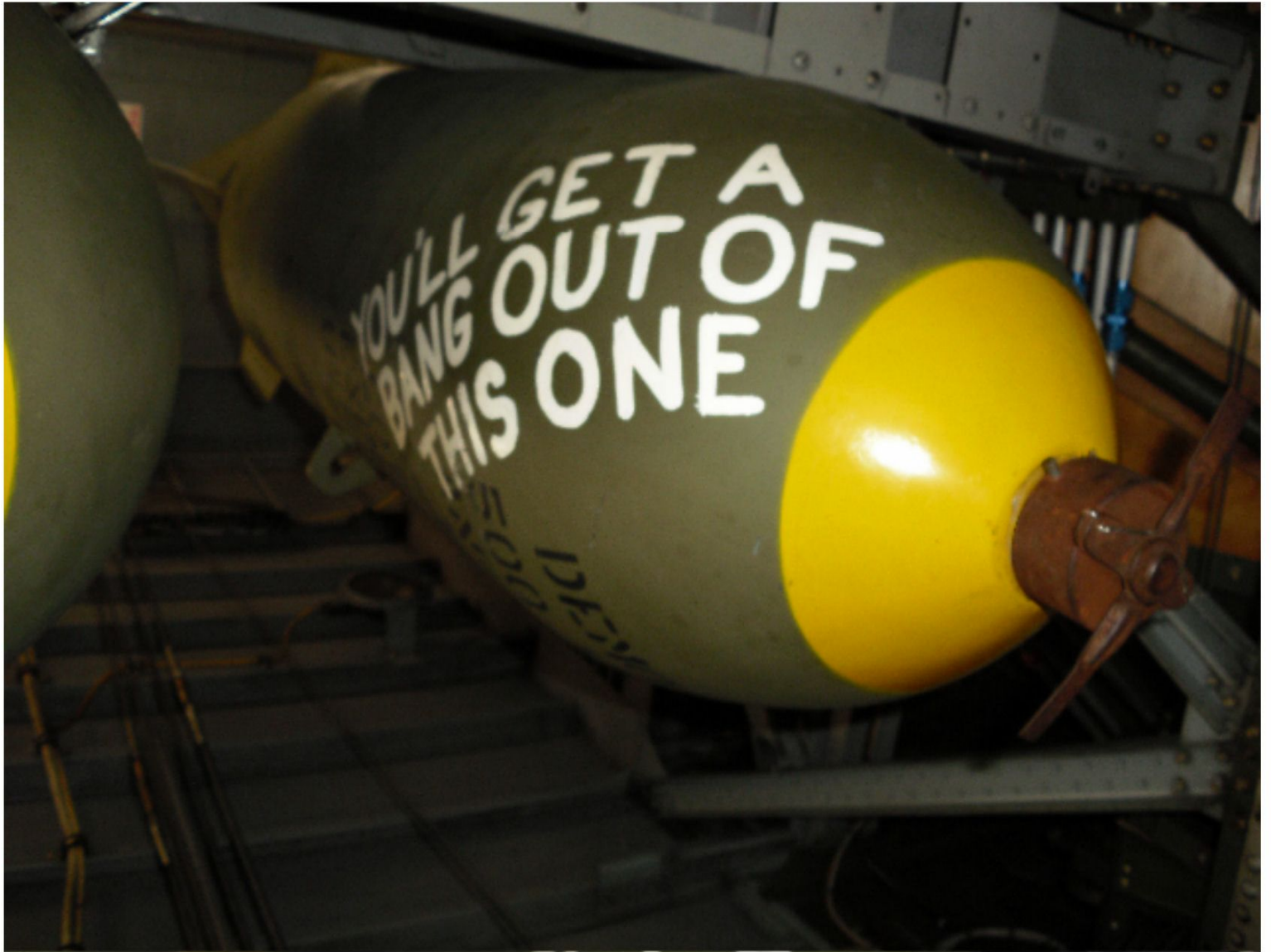
Bomb rack in B-24 "Witchcraft"