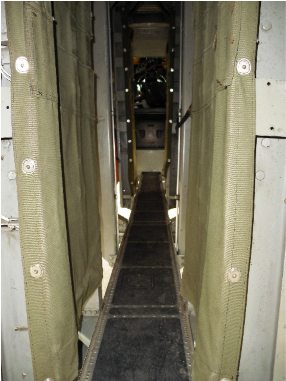
The walkway through the bomb bay